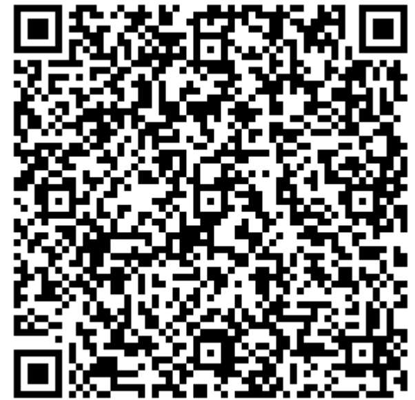
Information on training options