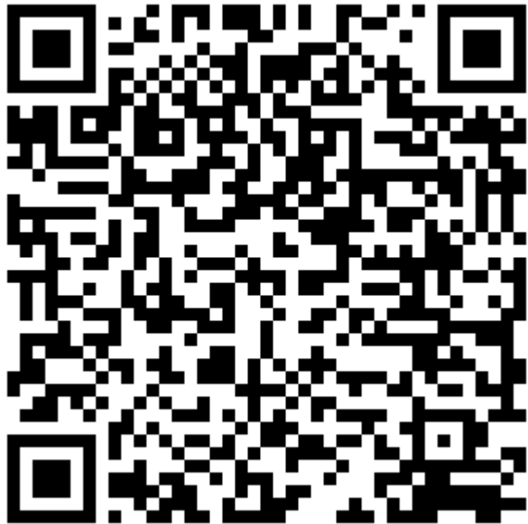
Booking Form (online training)

Change Your Mind is an excellent addition to any pupil's CV, providing plenty of experience they can use in interviews and enabling them to develop skills for the workplace. In addition, by developing and delivering workshops during the programme, they are enhancing their understanding of key issues taught in PSHE . Encompasses primary school outreach, teamwork, leadership, mentoring, project-based work and more