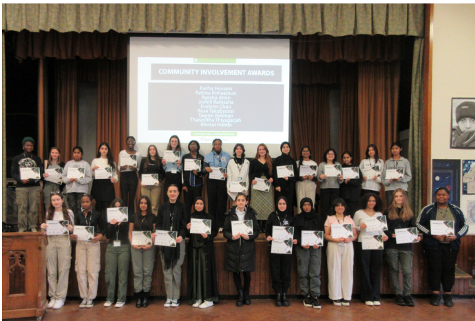
Year 12 Achievement Assembly