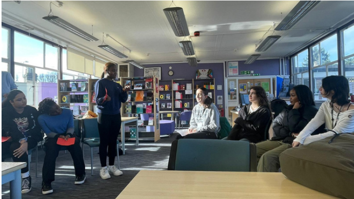
'The Big Debate' on whether teacher strikes are responsible or irresponsible