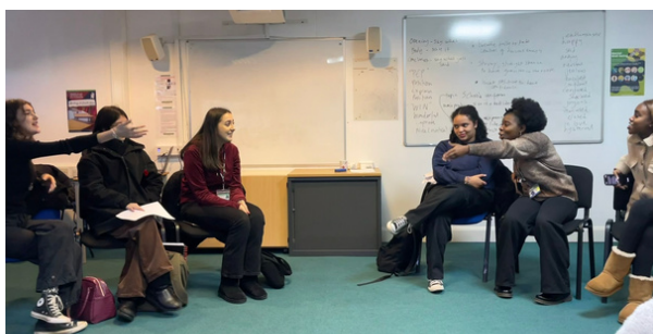
'The Big Debate' about train strikes