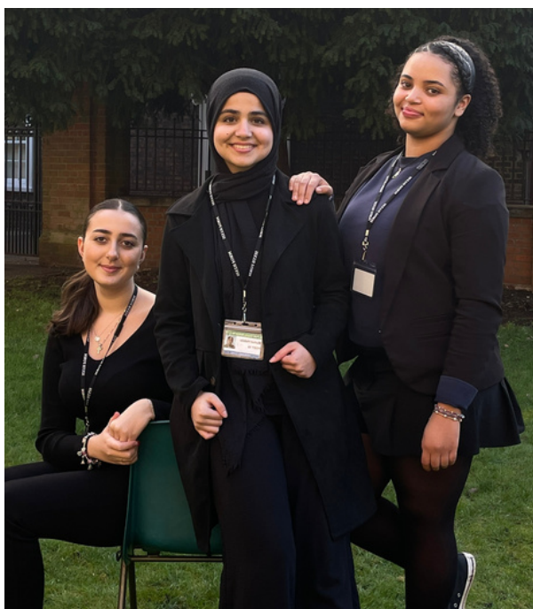
The new Year 12 Head Girl Team