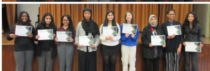
Year 13 Achievement Assembly