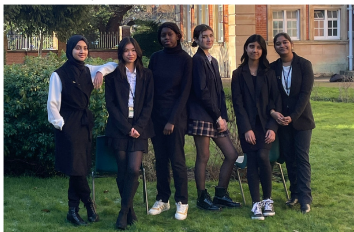
The new Year 12 House Leadership Team