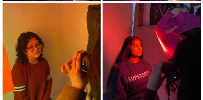
Photography coursework shoot