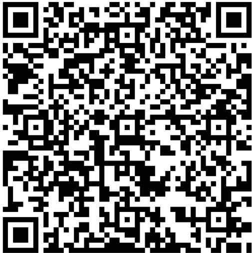
A Taste of Economics and Finance

Our Pre-University Summer School is a 10 night fully-inclusive residential academic enhancement programme combining a stay at Warwick's beautiful campus and day trips to our exciting Capital City London and the dreaming spires of Oxford.