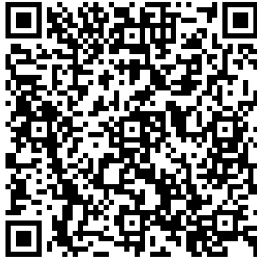
A Taste of Science and Engineering