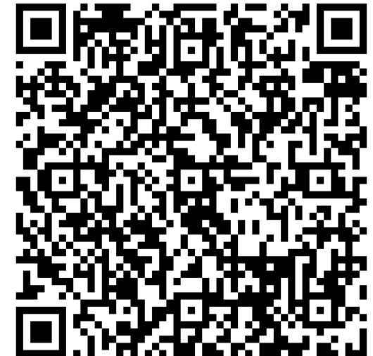
A Taste of Social Sciences

Experience: engaging with like-minded peers from around the world, a taste of University life and undergraduate teaching from top Warwick faculty, outstanding guest speakers, personal effectiveness training, including leadership and communication skills, preparing for University in the UK, living on the beautiful and self-contained Warwick campus, visiting some of the most iconic places in the UK, including London and Oxford