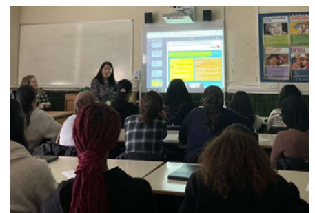
Health & Social Care guest speakers