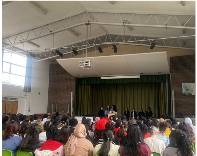
Introductory presentation by the Year 12 Head Girl and Broader Leadership Team