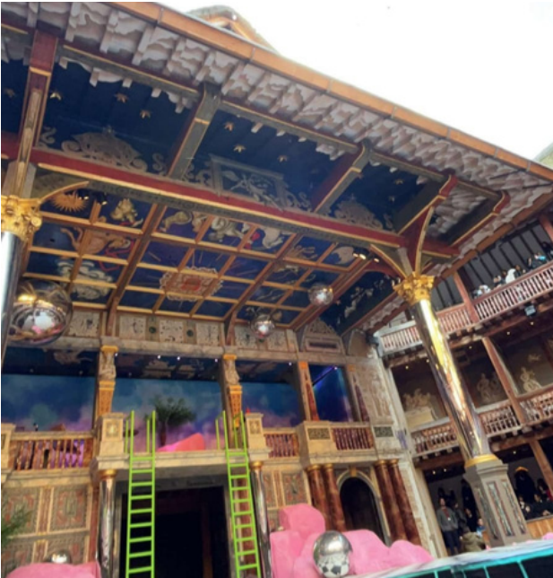
English Language trip to the Globe Theatre