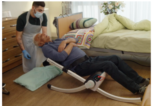
An emergency fall lifting chair called a 'Raizer II' used by an advisor from 'Safe and Connected'.