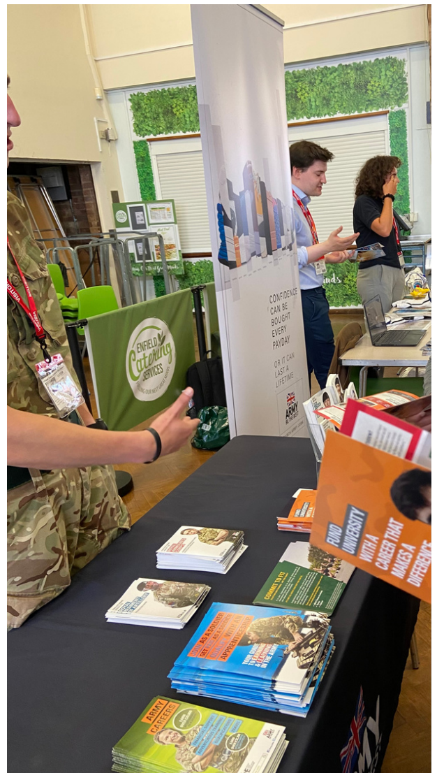
ECSfG Careers Fair