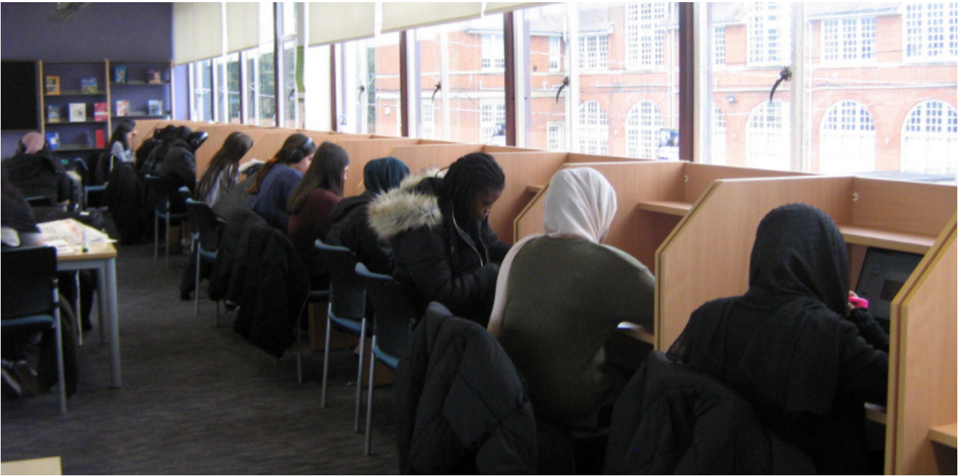
Research on different courses, universities and alternative Post 18 pathways during Progression Day