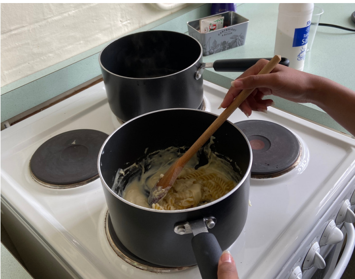
'Cooking on a budget' during Progression Day