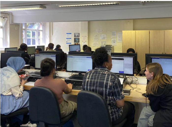
Session on writing personal statements during Progression Day