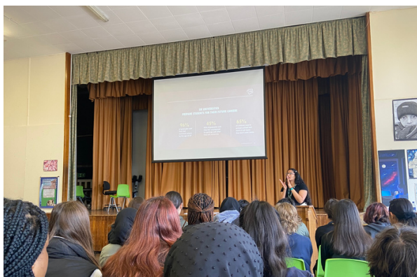
Guest speaker from the London Interdisciplinary School (LIS)