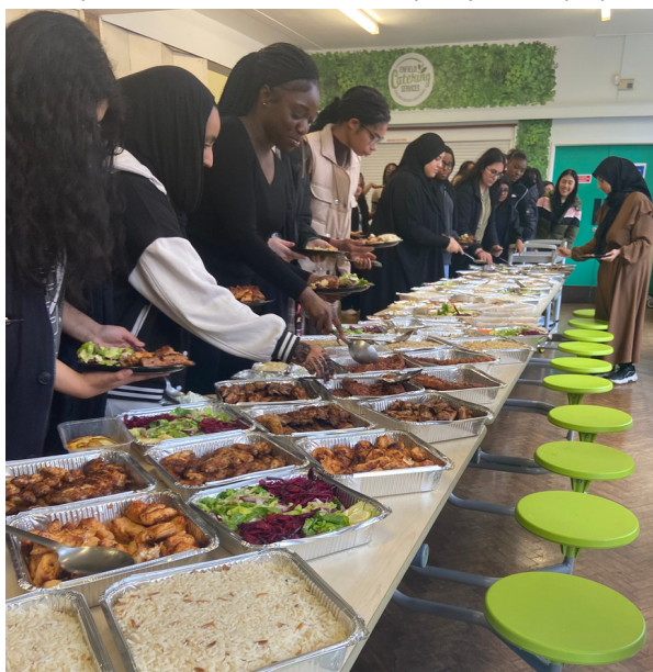
Year 13 Leavers Party