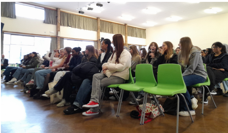
Year 13 Leavers Awards Assembly