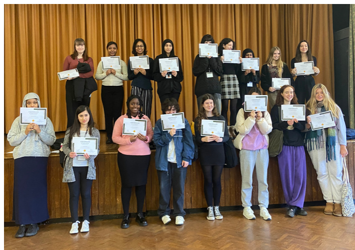
Year 13 Achievement Assembly