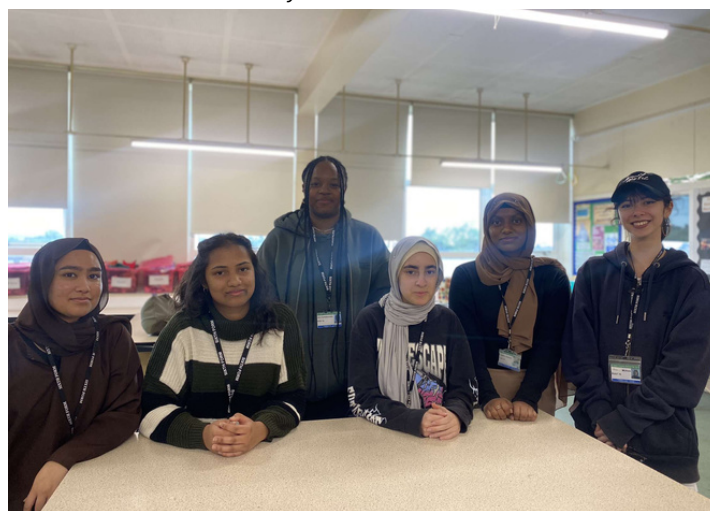
Year 12 Mentors for the Big Sister Program