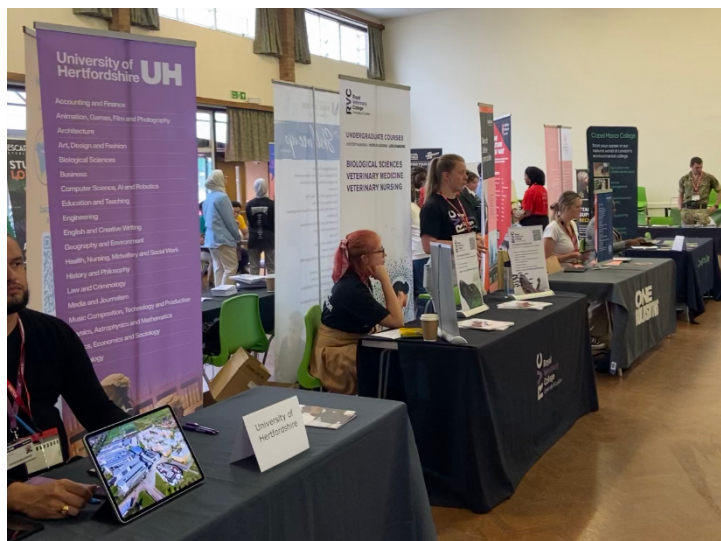
ECSfG Careers Fair