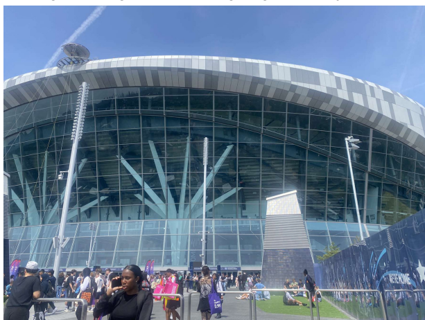
Tottenham Careers Fair Trip