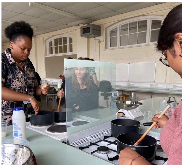
'Cooking on a Budget' session during Progression Day