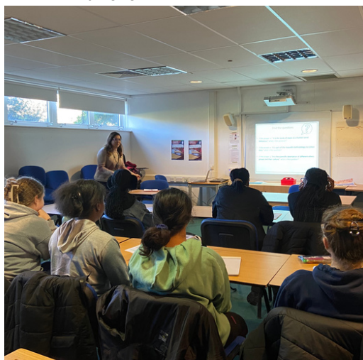
Brilliant Club Meeting