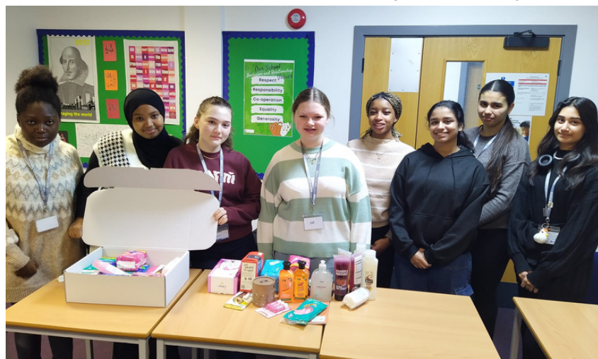
Donations gathered for the Enfield Women's Centre (EWC)