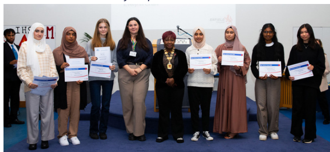
High Achievers Evening at St Ignatius College