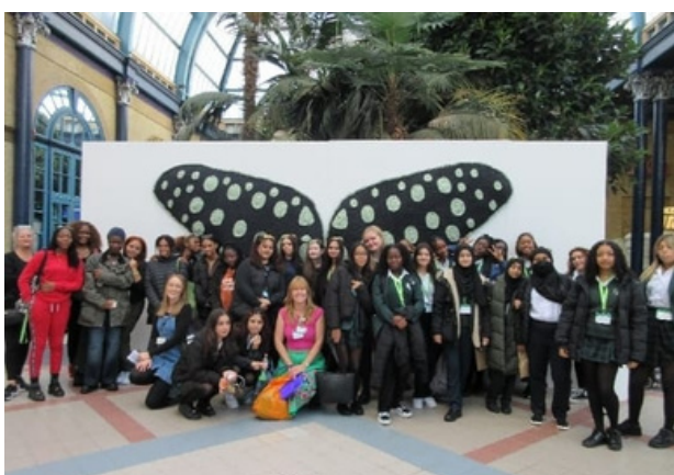
Textiles trip to the 'Knitting & Stitching show', Alexander Palace