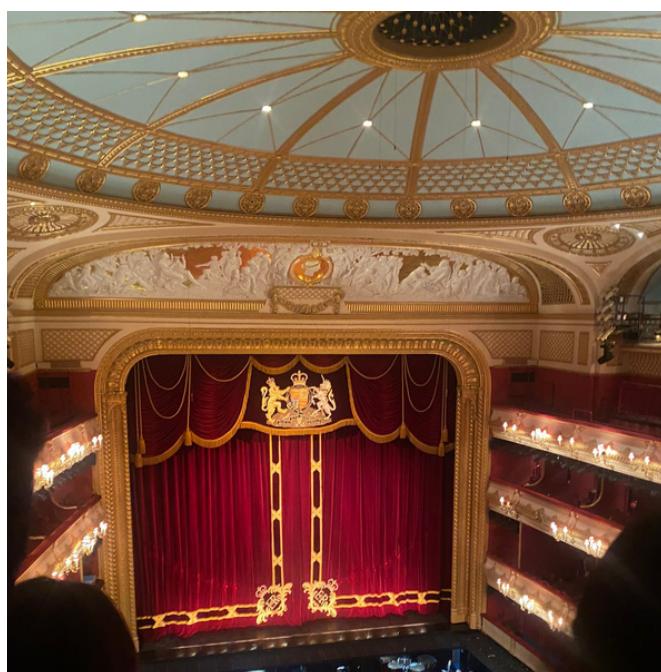
Music students visit the Royal Opera House